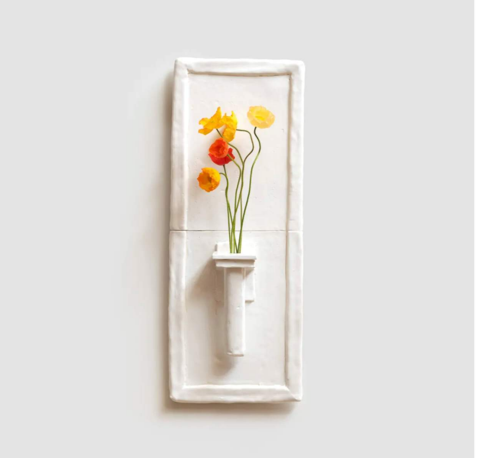
A Ben Mazzy ceramic wall-mounted candleholder.

"I think this flourishing of interest shows that our instincts were right," she says. "Australian collectors are now appreciating not just the visual art, but the functional arts and collectable design."