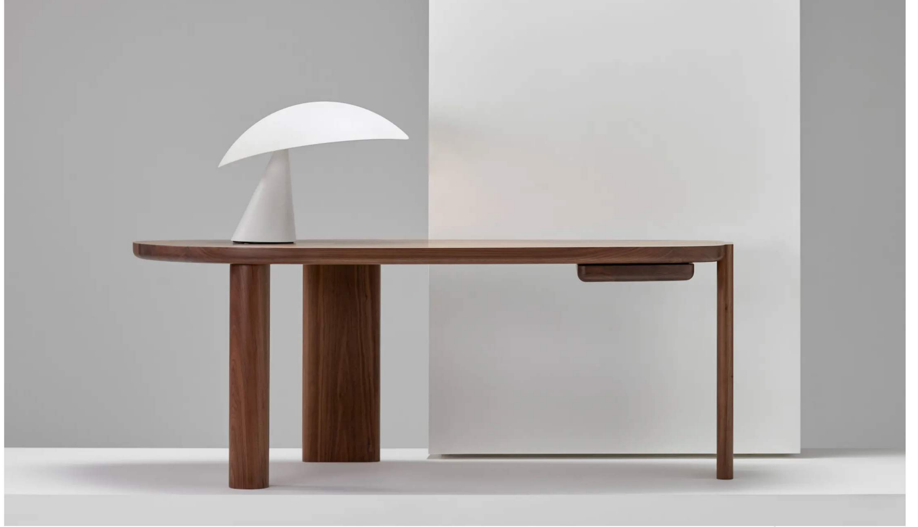
The walnut desk designed by Don Cameron.

A collaboration between the Melbourne Art Foundation and the National Gallery of Victoria, the fair brings together 10 leading galleries, organisations and agencies – including Sullivan+Strumpf (Sydney), JamFactory (Adelaide) and Melbourne's Broached Commissions – to show one-off and limited-edition pieces that teeter along the increasingly fine line between art and design.